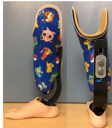
Figure 5. Crossover ESAR Foot

A relatively new posterior-mounted carbon fiber blade with a heel module and foot shell enables children with long transtibial or Symes amputations to be fitted with an ESAR foot, whereas they did not have the clearance for traditional ESARs mounted at the distal socket. One version includes a slot in the carbon pylon to allow lengthening as the child grows (Figure 5). 28 Uniquely, this foot also enables the prosthetist to switch out the heel plate for a longer one and to then use a bigger foot