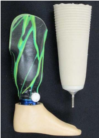
Figure 4. Prosthetic Locking Liner With the availability of smaller prefabricated liners and lock mechanisms, this is now a suspension option for children's prostheses.

but these new hands provide precision index pinch, lateral pinch, and numerous other patterns in addition to three-jaw chuck. 21 A user can switch between grips in several ways: myoelectric signal, limb movement, selection button on the prosthesis, or a smartphone app.