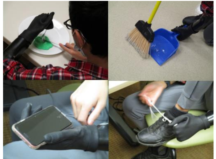
Figure 3. Myoelectric Multi-articulating Hand Multi-articulating hands allow teens to use many different grips, beyond a traditional three-jaw chuck, which allow greater task variability as seen here.

Socket advances have sought to improve patient comfort while improving control of the terminal device. Rolled