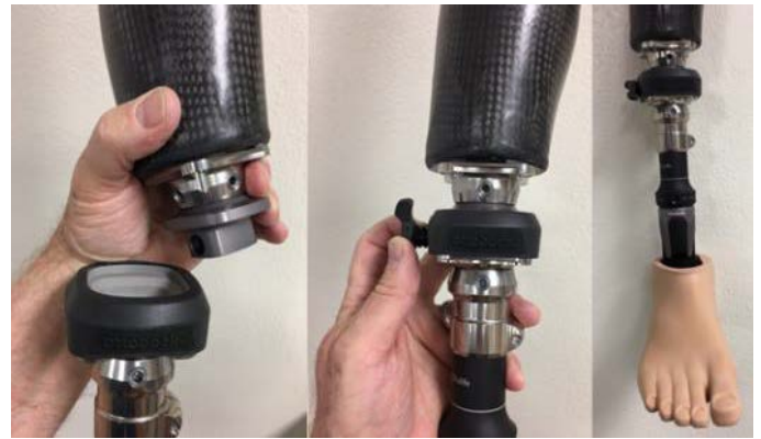
Figure 6. Quick Disconnect Adapter This adapter allows the teen to switch between a daily and sports-specific prosthetic foot at their choosing.

Microprocessor knees are thought to improve stability, safety, and gait quality in adults with transfemoral amputation. These knees can also be used successfully by adolescents, though there are several potential limitations. Many microprocessor knees are not durable and have limited water and dirt tolerance, challenging their use with highly active adolescents. Additionally, these knees are often too large and/or heavy for adolescents and children. A good candidate for microprocessor technology would be an adolescent with bilateral amputations who has potential for unlimited community ambulation (K-level 3). Patients with bilateral amputations may benefit from the enhanced stability and control that microprocessor knees provide on stairs, inclines, and uneven terrain.