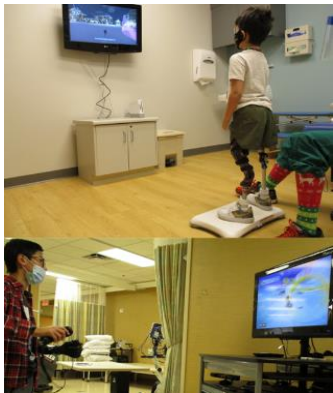
Figure 7. Virtual Training Motivation of children may be increased with the incorporation of video games or virtual reality activities. These activities require the children to shift weight on their leg prostheses or move their arm prostheses to play the games.

prosthesis. This could be integrated into the virtual reality applications for advanced training.