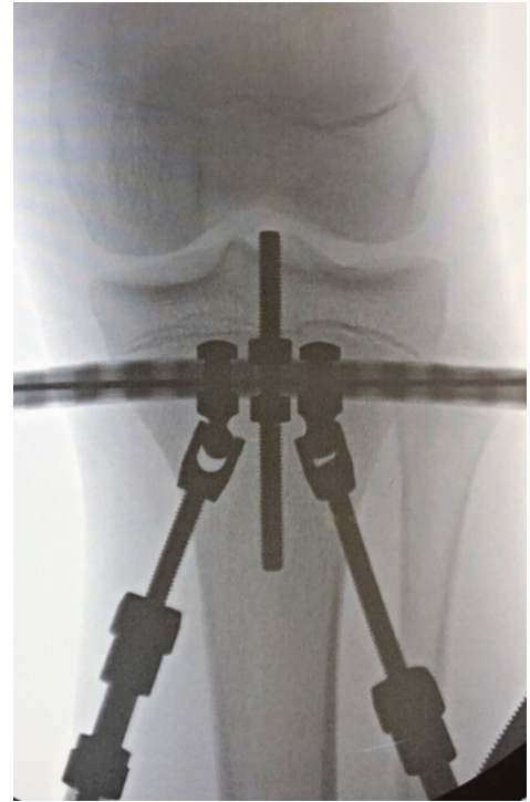
Figure 2. Intraoperative radiograph demonstrating placement of the initial reference wire to the proximal ring. This is the most important step in the external fixator application process. Spend extra time to ensure the alignment is perfect. A temporary threaded rod inserted in the center hole can be used as a visual guide to help determine the ring alignment.

Ring placement depends on the surgeon's preferred method. If the frame has been prebuilt, slide the frame onto the limb and verify that the ring sizes are correct. Determine if each ring is orthogonal to its respective bone segment as planned and make any strut adjustments as necessary. If the surgeon prefers the rings first method, slide each individual ring onto the patient and determine the correct ring size. If a full ring is going to be used proximally, make sure this ring is already in place on the limb before beginning to attach the distal ring(s).