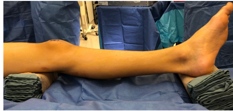
Figure 1. Proper positioning makes the frame application easier. Place a bump under the hip to hold the patella in a directly anterior position. Bumps under the thigh and ankle will allow the external fixator to be manipulated on the limb without obstruction from the operating room table.

Other preoperative decisions include the number of rings to be used to build a stable frame construct and the num-