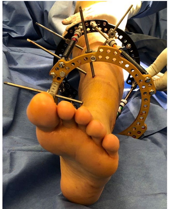
Figure 4. The final frame construct should have a combination of half pins and wires placed at multiple angles and spread out over the length of each bone segment. A minimum of two to three fixation elements should be attached to each ring.

Even with the most thorough preoperative plan, things may not go entirely as expected in the operating room.